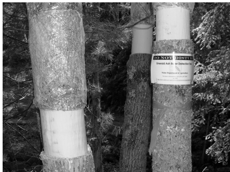
Ash trees at Oak Grove Cemetery in Bath have been girdled, with Tangle foot® applied above the girdled area to trap flying beetles.

Ann Gibbs, at 207-287-3891 or ann.gibbs@maine.gov , or Tom Hoerth, at 207-443-8345 or thoerth@cityofbath.com